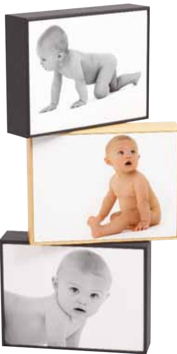
Black or pine panel blocks

Matching mouldings with mounts can sometimes be difficult to visualise so here are a few ideas to inspire you.