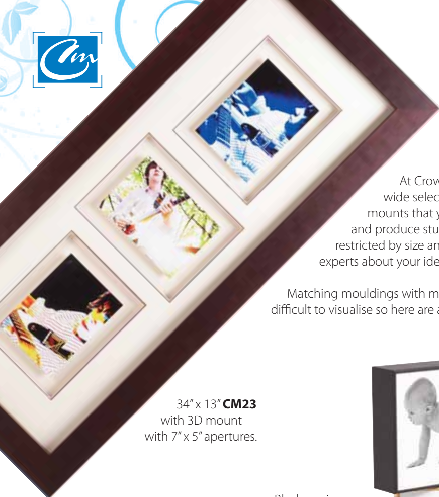
34" x 13" CM23 with 3D mount with 7" x 5" apertures.

At Crown we have such a wide selection of frames and mounts that you can really get creative and produce stunning portraits. Don't be restricted by size and format, speak to the Crown experts about your ideas or for advice.