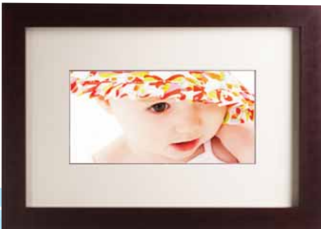
24" x 16" CM23 with double mount in cream and burgundy.