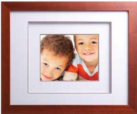
20" x 16" CM7 with 3D mount featuring a double mount in white and burgundy.